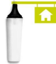
Real estate, construction and environment