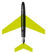
International trade and contracts