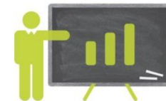
Training and publications