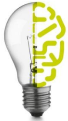
IPR and ICT