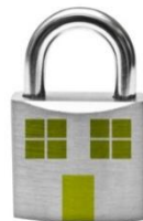
Marketing law and data protection