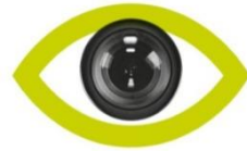
Competition law and public procurement